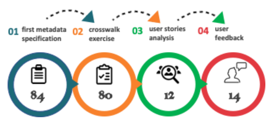
Figure 2: Metadata analysis & recommendation process

The process used by the group provided the means for the collection of a "master list" of 84 metadata elements for learning resources to be whittled down to the current 14 elements.